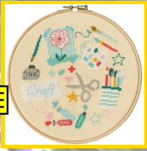
XHS12 18 x 18 cm (7" x 7") My Craft Den