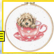
XHD119 15 x 15 cm (6" x 6") Teacup Pup