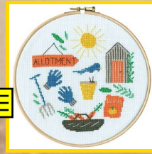
XJH3 18 x 18 cm (7" x 7") Allotment