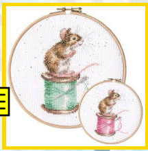
XHD114 15 x 15 cm (6" x 6") Sew it Begins