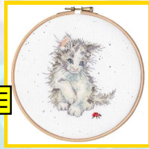
XHD118 15 x 15 cm (6" x 6") Ladybird