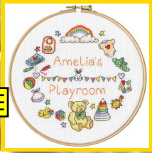
XHS15 18 x 18 cm (7" x 7") My Playroom