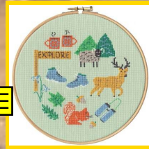
XJH6 18 x 18 cm (7" x 7") Explore