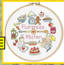
XHS13 18 x 18 cm (7" x 7") My Kitchen