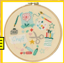
XJH7 18 x 18 cm (7" x 7") Craft