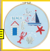
XJH2 18 x 18 cm (7" x 7") Beach