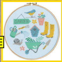
XJH4 18 x 18 cm (7" x 7") Garden