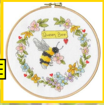
XETE10 18 x 18 cm (7" x 7") Queen Bee