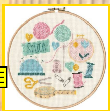
XJH8 18 x 18 cm (7" x 7") Stitch