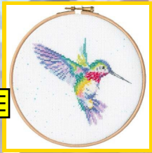
XHD120 15 x 15 cm (6" x 6") Humming Along