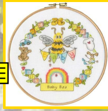
XETE11 18 x 18 cm (7" x 7") Baby Bee