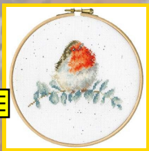
XHD121 15 x 15 cm (6" x 6") Eucalyptus