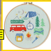
XJH5 18 x 18 cm (7" x 7") Adventure