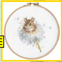
XHD117 15 x 15 cm (6" x 6") Dandelion Clock