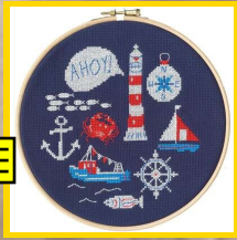
XJH1 18 x 18 cm (7" x 7") Ahoj