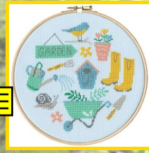
XHS14 18 x 18 cm (7" x 7") My Garden