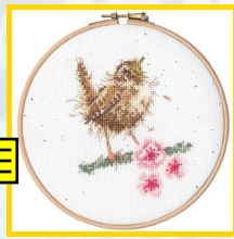
XHD115 15 x 15 cm (6" x 6") Little Tweets