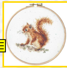
XHD116 15 x 15 cm (6" x 6") Acorns